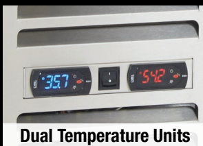
Dual Temperature Units