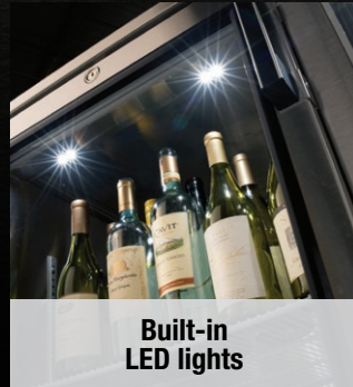
Built-in LED lights