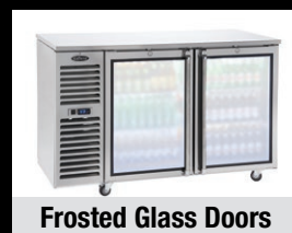
Frosted Glass Doors