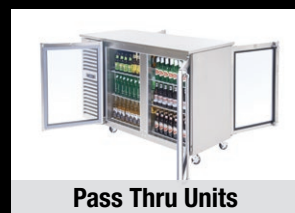
Pass Thru Units