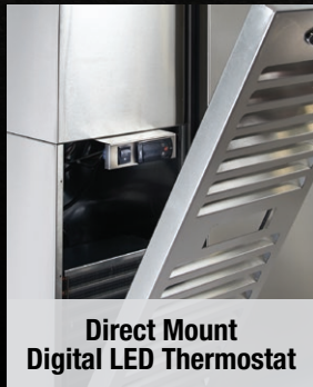
Direct Mount Digital LED Thermostat