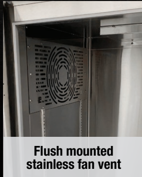
Flush mounted stainless fan vent