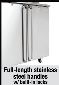
Full-length stainless steel handles w/ built-in locks