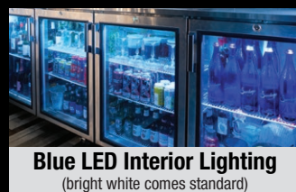
Blue LED Interior Lighting (bright white comes standard)